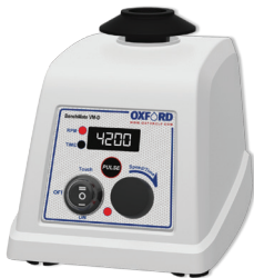
Digital Vortex Mixer (VM-D)