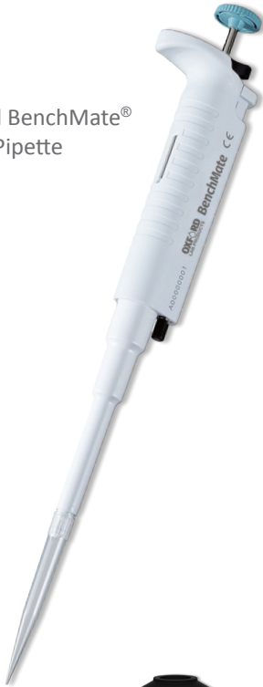
Original BenchMate® Pipette