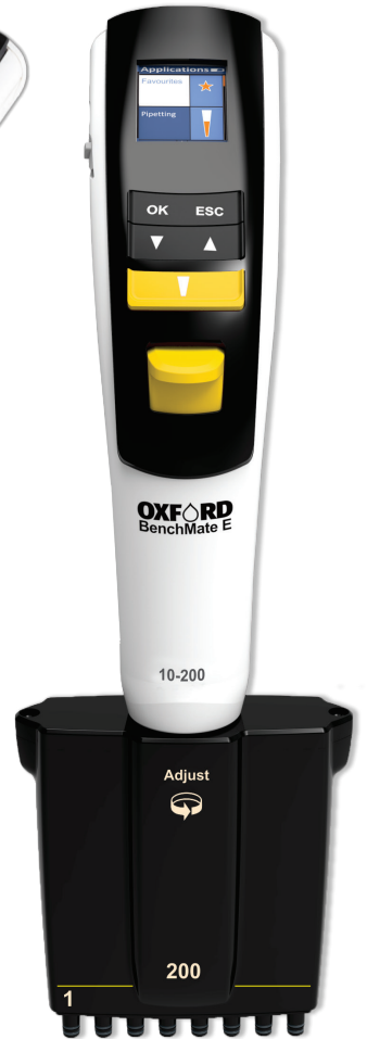
BenchMate® E Single and Multi Channel Electronic Pipettes