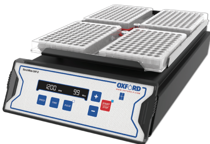
Digital Plate Shaker (S4P-D)