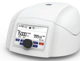
High Speed Microcentrifuge (C12V)